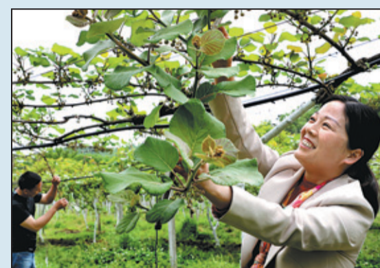
A farmer checks the health of a kiwi fruit tree on a plantation in Jinzhai.