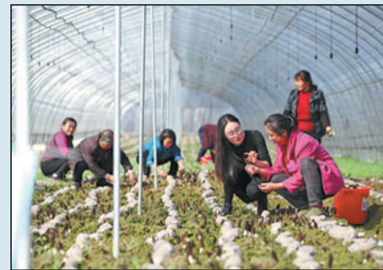
Farmers harvest morel mushrooms in a greenhouse in Jinzhai county, Anhui province.

"I will never forget chatting with General Secretary Xi Jinping that day," he recalled. "He sat in the front yard of my house for a meeting with the villagers and officials and asked me if I had any wishes, and I said I hoped my income would double that year. That wish was later more than fulfilled."