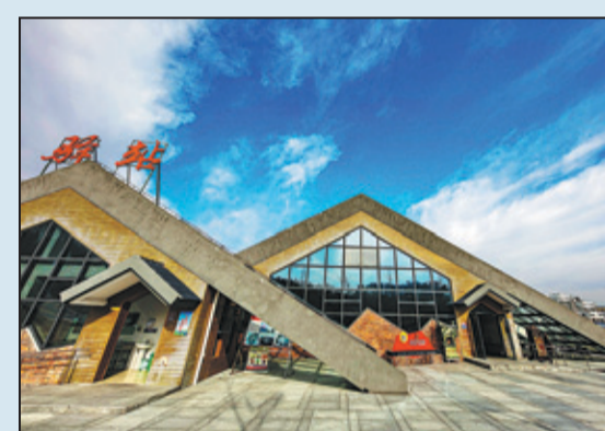
A guesthouse caters to increasing numbers of tourists in Jinzhai.