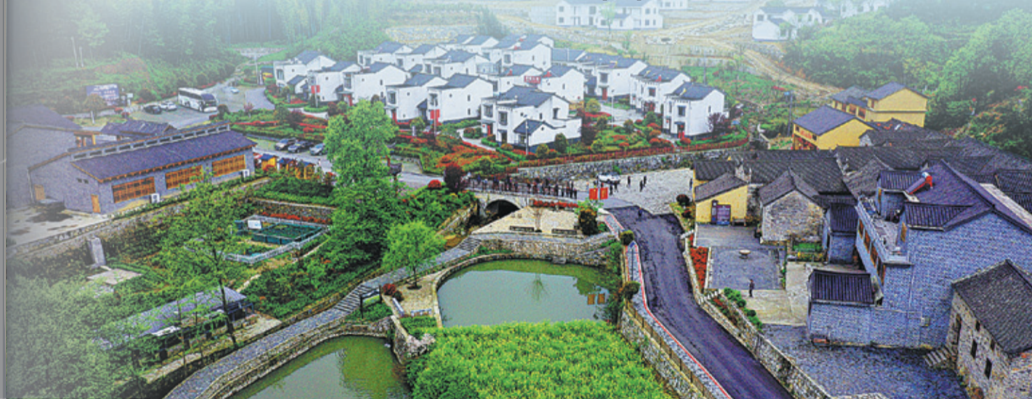
Right: An aerial photo shows Dawan village in Jinzhai county, Anhui province.