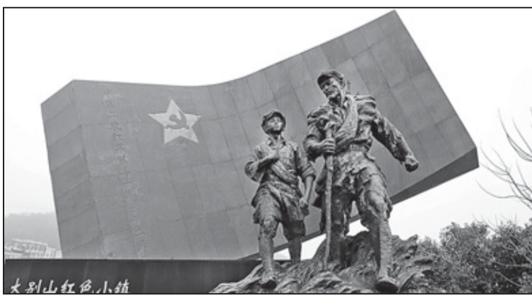
Statues of Red Army soldiers at a Red tourism site in Jinzhai county, Anhui province.

Red forces quickly expanded after the regrouping. By November 1931, it could count on nearly 30,000 soldiers. Second only in size to the Central Red Army, it was renamed the Red Fourth Front Army, and was led